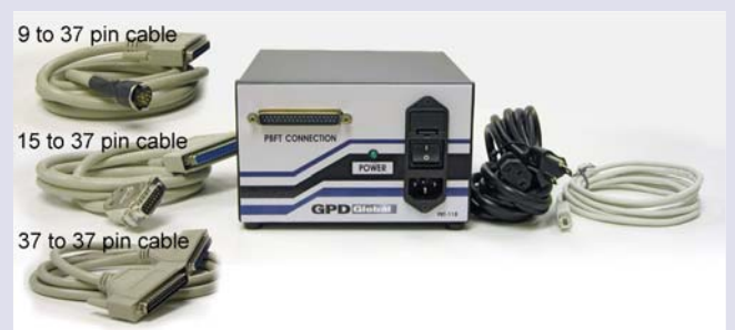
Kit shown (PN PBT-118-4) includes all 3 cables

Upgrading is simple. Just plug in the hardware to your PBFT, computer, and power source as shown below and install the software following instructions included in the PBFT VS SPC User Guide .